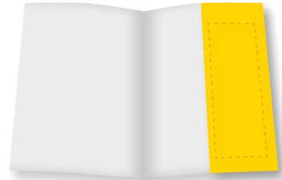
1 / 2 page (high) W 102 mm x H 280 mm