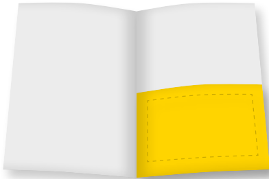
1 / 2 page (wide) W 210 mm x H 140 mm