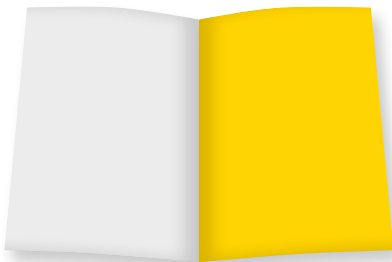
U 3 inside back cover W 210 mm x H 280 mm