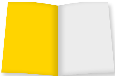
U 2 inside cover W 210 mm x H 280 mm