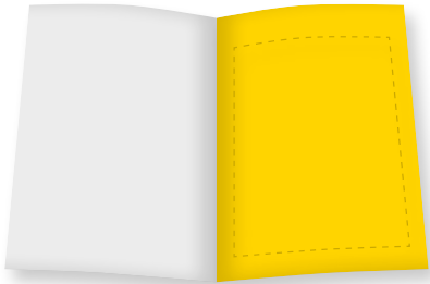
1 / 1 page W 210 mm x H 280 mm