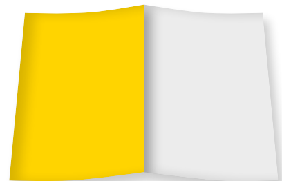
U 4 back cover W 210 mm x H 280 mm